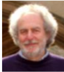
Prof. Doug ALTMAN, DSc (Guest of Honour at the Conference)